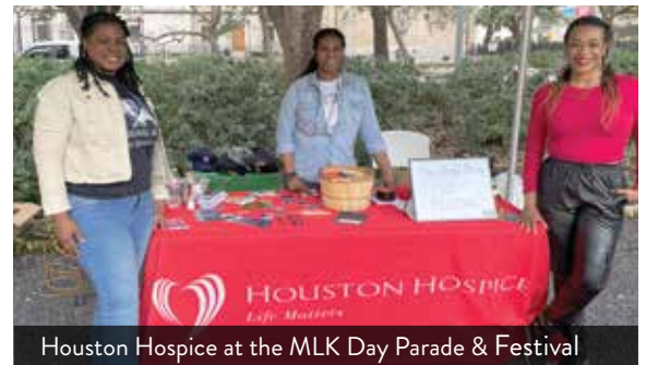
Houston Hospice at the MLK Day Parade & Festival

Last November, a young 36-year-old mother who was in Houston Hospice's inpatient unit, knew her time was growing short and she was sad that she would miss her 17-year-old daughter's high school graduation.