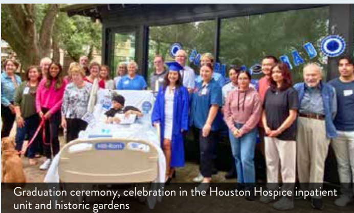
Graduation ceremony, celebration in the Houston Hospice inpatient unit and historic gardens

Extended family members from near and far were present to enjoy the celebration, as was our newly minted volunteer group ... And let's not forget the cake!