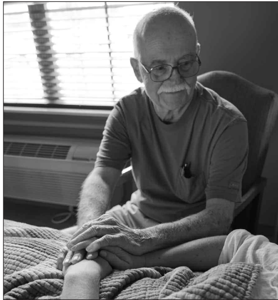
Houston Hospice family at Grace Care Center

With Houston Hospice located in Grace Care Center, an additional level of care is provided at the Center. This not only allows Houston Hospice to care for the more critically ill patients, but patients cared for in their own homes or other facilities can take